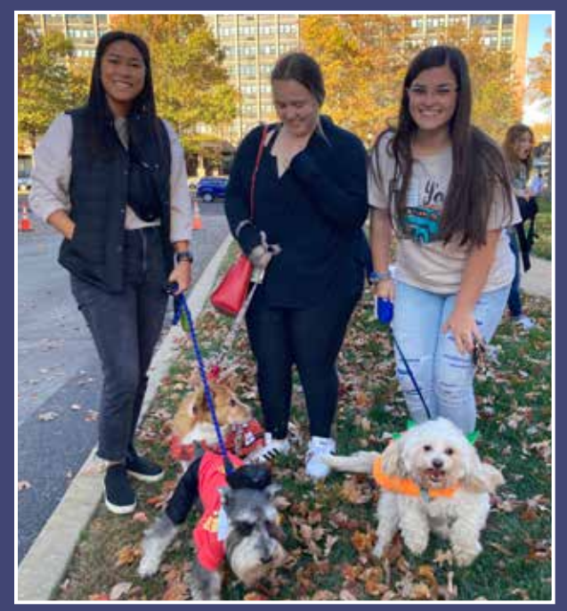
On Oct. 26, students brought their furry friends to the inaugural Regina Abel Costumed Dog Parade.