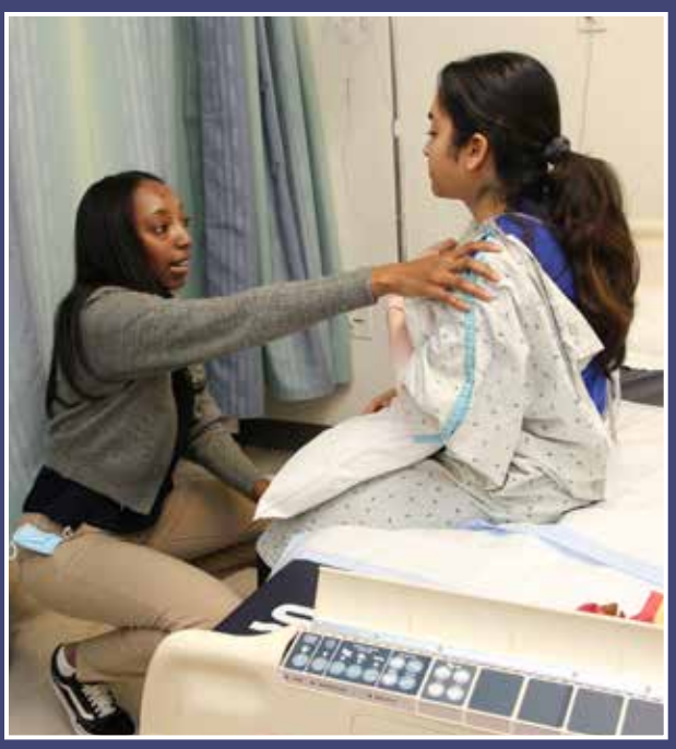
Students practiced competencies related to cardiopulmonary conditions in the hospital simulation lab on Feb. 21.