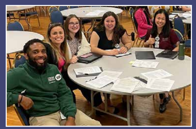
On Nov. 10, WashU OT faculty, staff, alumni and students attended a public hearing on early intervention in Jefferson City, Mo., to advocate for occupational therapy.