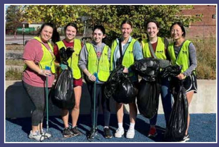
WUSOTA celebrated World OT Day and OT Global Day of Service by holding a park clean-up in collaboration with Great Rivers Greenway on Oct. 27.